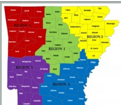
AAFC District Map

For more information Check out the AAFC website